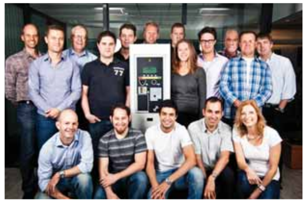
CWT Compact Development Team

All these advances mean that today's parking technology is unrecognisable from the 1930s. The common driver for all of them is simplification. Simplification for everyone - customers and operators. Welcome to the future.